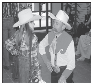
Baxter Black, NPR/ KCCU Commentator, visits with with a fan during an August Museum of the Great Plains fundraiser

T he Friends of the Museum of the Great Plains hosted NPR/KCCU Commentator Baxter Black in a benefit concert at the McMahon Auditorium on August 7. The audience